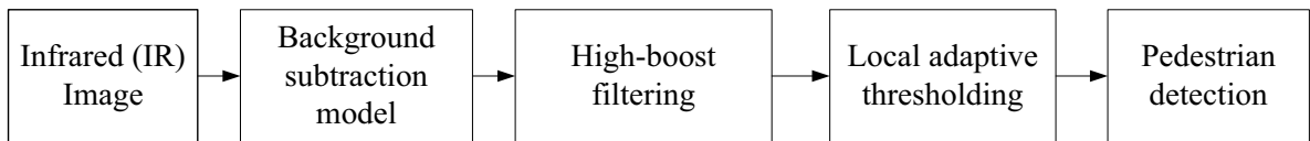
Fig. 1. The block diagram of the proposed method

where X(i, j) denotes the foreground information of an image and Y(i, j) represents the background information of an image. Background subtraction model works based on the pixel properties of the image. The goal of this model is to suppress the background information of the image. The background suppression is done by evaluating the gray-scale of background using peak of the histogram and then subtract it from the image pixel. It is defined in equation (2).