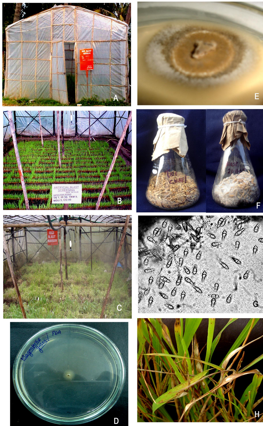
Figure 1. A, B. Well equipped artificial screen houses for rice blast screening with prepared trays beds. C. Artificial screen house equipped with mist blowers to maintain (RH) at 95% and leaf wetness. D. Five days after inoculation of the symptom, kept at 24-26 degrees celsius, immersed mycelial growth appears. E. An effused colony, thinly hairy, turning from olivaceous brown to greyish brown with immersed mycelium and wedge shaped centre was seen. F. Inoculated conical flasks maintained at 27 degree celsius at 90% RH inside fluorescent incubator for 15 days. G. Observation of rice blast spores at 15 - 20 days after inoculation in Leitz (Flovert FS) microscope under the magnification of 100x. H. Disease incidence after spraying of artificial rice blast sporulated inoculam with spore concentration adjusted to 50,000 conidia.ml -1 suspension with 0.5% gelatin spores (approx) 2 to 3 times inside the screen house for disease induction..