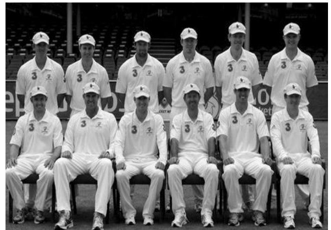
Fig.2. Original Image