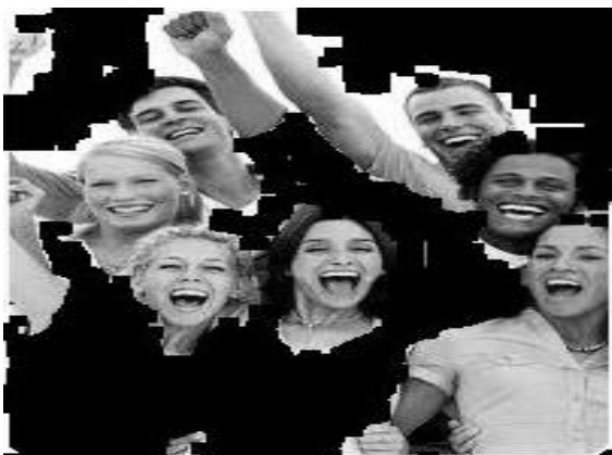
Fig.6. Morphological image