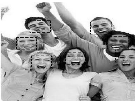
Fig.7. Face marked image