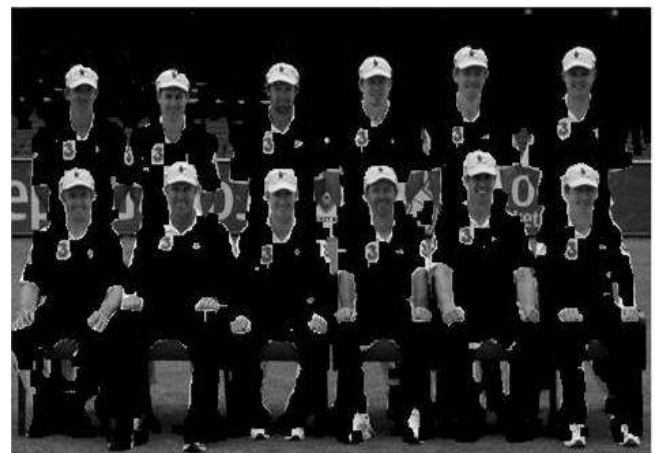
Fig.3. Morphological image