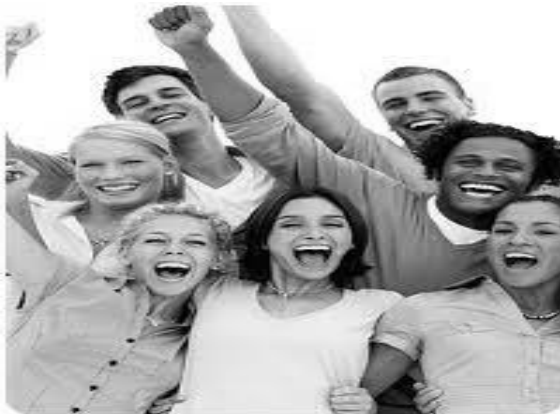
Fig.5. Original image