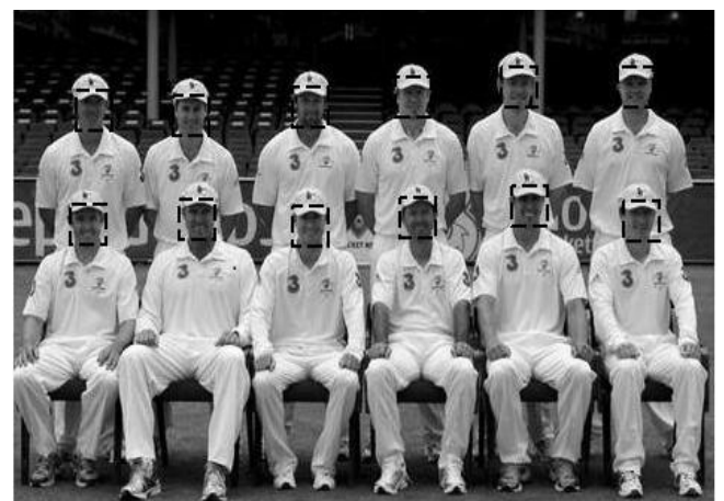
Fig.4. Face marked image