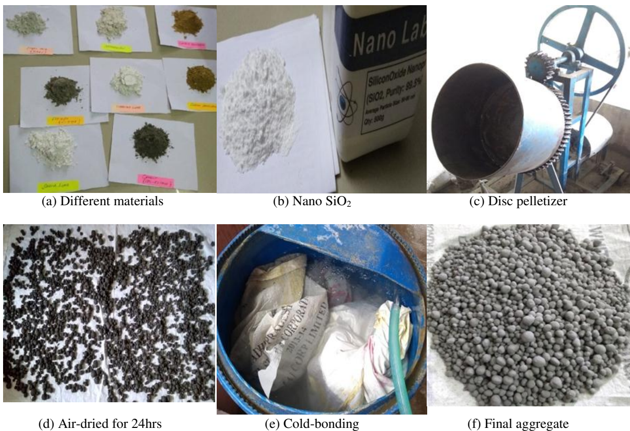
Figure 1 Manufacturing process of the artificial lightweight aggregates

For the manufacture of the artificial light weight aggregates, a disc pelletizer was employed, as shown in Figure 1. The pelletizer disc was fabricated with a diameter of 500mm with 250mm depth; the inclination angle could be modified between 35° and 50°, and the rotating speed between 40 and 55rpm (Bijen, 1986; Harikrishnan & Ramamurthy, 2006). Following the preliminary investigations conducted on the pelletization method, the inclination angle was fixed at 36°, with a rotation speed of 55 rpm and standard pelletization time of 17 minutes in order to attain maximum efficiency. A total of 12 types of lightweight aggregate were manufactured, with and without the addition of nano \text{SiO}_2 , as specified in Table 2.