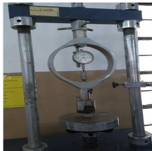
Figure 3 Crushing strength test apparatus