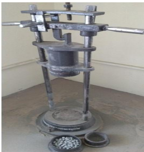
Figure 2 Aggregate impact test apparatus

Where P is the failure load and X is the distance between two plates or diameter of the pellet.