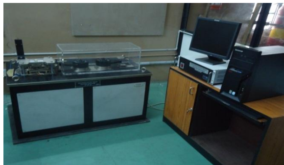
Fig.1 High frequency reciprocating wear test machine

10mm. Surface texturing was done on top face of lower specimen. This pin and flat surface type arrangement was used to simulate operating conditions of piston rings so as to ensure complete conformity, as it is found that achieving complete conformity is difficult in case of ring and liner type arrangement of reciprocating wear test. Texturing was carried out on the lower specimen.