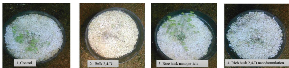
Figure 3. Bioactivity of rice husk-based 2,4-D nanoformulation against target weed Brassica sp. in comparison with other conventional methods [9].

In a study by Abigail et al. [9], an attempt was made to nanosized rice husk waste and was used as nanocarrier for 2,4-dichlorophenoxyacetic acid herbicide (2,4-D). The rice husk waste was brought down to nanosize and was surface adsorbed with 2,4-D to act as herbicide nanocarrier. The rice husk nanocarrier showed enhanced and reversible sorption of 2,4-D, illustrating its uniqueness to act as good carrier for encapsulating herbicides. The adsorption of 2,4-D on to the rice husk was not found to minimize the herbicidal activity when tested against target weed, Brassica sp. in comparison with free 2,4-D ( Figure 3 ). The rice husk-based herbicide delivery system could be a boon due to its multiple advantages of utilizing the waste constructively apart from effectively using the herbicide with environmental contamination. Thus, the evolution of weeds with acquired resistance due to the uncontrolled use of herbicides could be eradicated with the help of these nanostructured herbicide carriers.