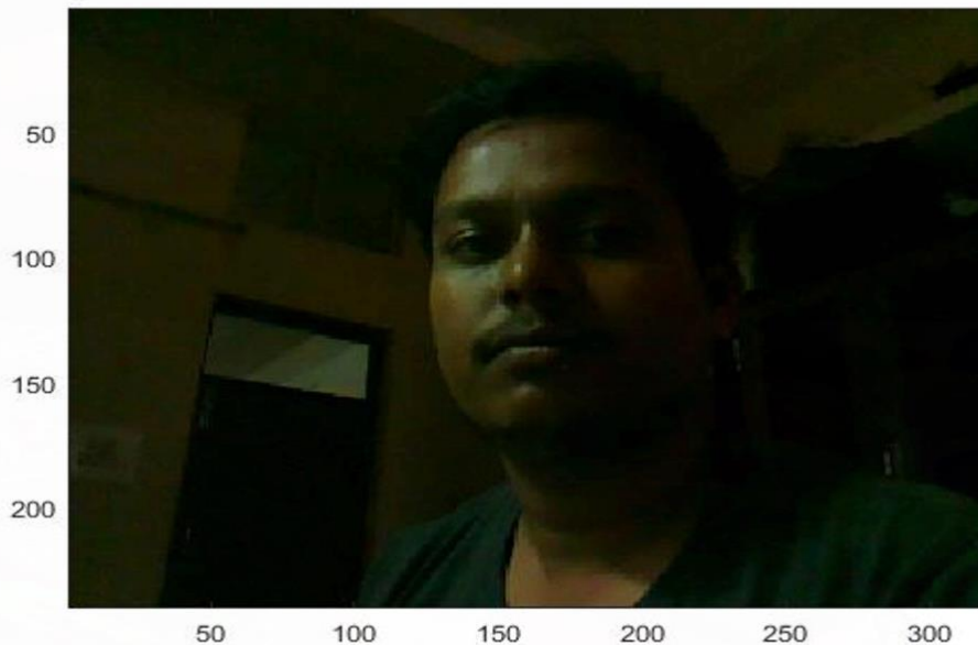
Figure 3. Decoder output (Information Image)