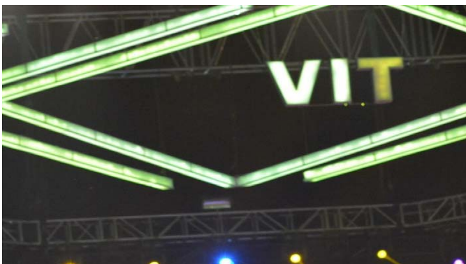
Figure 2. Encoder output (Watermarked Image)

The MATLAB code will check the password criteria and does the further part of encoding in steps. First it will ask the cover image to be inserted and then the information image i.e. person image to be encapsulated. The output of the encoder i.e. watermarked image and the output of the decoder i.e. information image is given below: