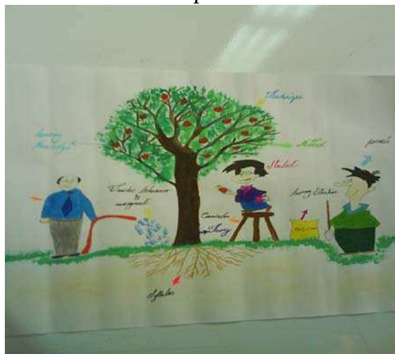
Figure 3. Reflection toward education and its education and components