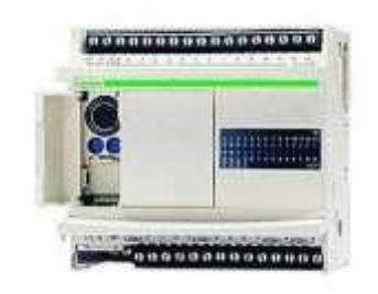
Figure 1. TWDLCAA24DRF PLC

A programmable logic controller (PLC) is a digital computer which is used in a variety of processing plants to do control functions. It replaces the sequential relay circuits for machine control. The PLC works by scanning its inputs and according to the conditions programmed, turning on/off its