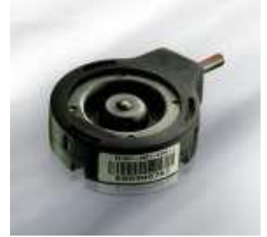
Figure 3. Piezo-electric load cell

Piezo- electric load cell is a type of weight sensing device which works on the principle of piezoelectric effect. When a load is placed on the sensor, the piezo-electric crystals inside get deformed and a strain is produced, and a voltage output is produced proportional to weight of the object.