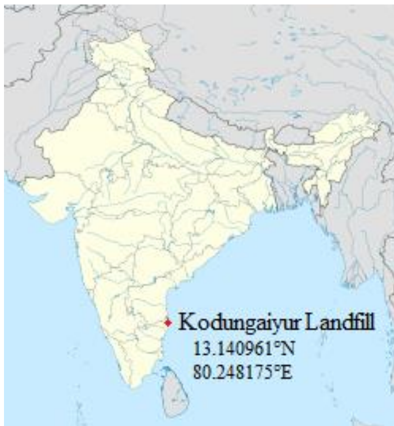
Fig.1. Kodungaiyur landfill on the Indian map

Electrical conductivity serves as an effective tool to quantify the hazards to crops caused by salinity. The EC of the sample is compared with the EC classification guidelines (Table 3), and it was arrived that three samples fall under doubtful class and one sample fall under good category, and the other five samples fall under the unsuitable category.