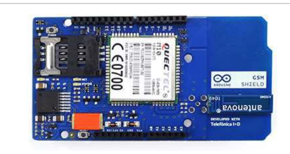
Figure 4: GSM shield is used along with the microcontroller.

signal to the CAN shield and the message sent to the can bus is according to the code which is flashed on the ATMEGA328 microcontroller. The CAN shield which we use has also a joystick along with it which could be used too actually control any device through simple logics. It also has GPRS module which we can use efficiently to tell the position of the vehicle. It has a port compatibility for the LCD panel to display any information as per requested by the user (Figure 4).