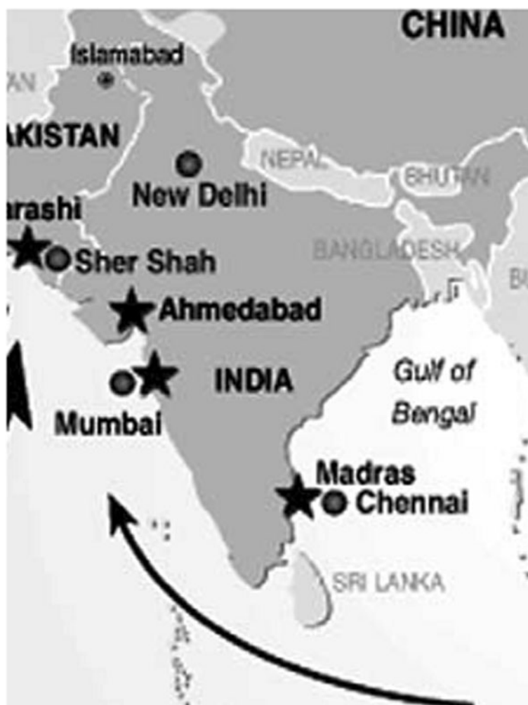
Figure 2 Major Indian ports receiving E-waste.

Over 1 million poor people in India are involved in the manual recycling operations of E-waste and most of the people working in this recycling sector are the urban poor with very low literacy levels and hence very little awareness regarding the hazards of e-waste toxins. There are a sizeable number of women and children who are engaged in these activities and they are more vulnerable to the hazards of this waste. The following three categories of WEEE account for almost 90% of the generation: