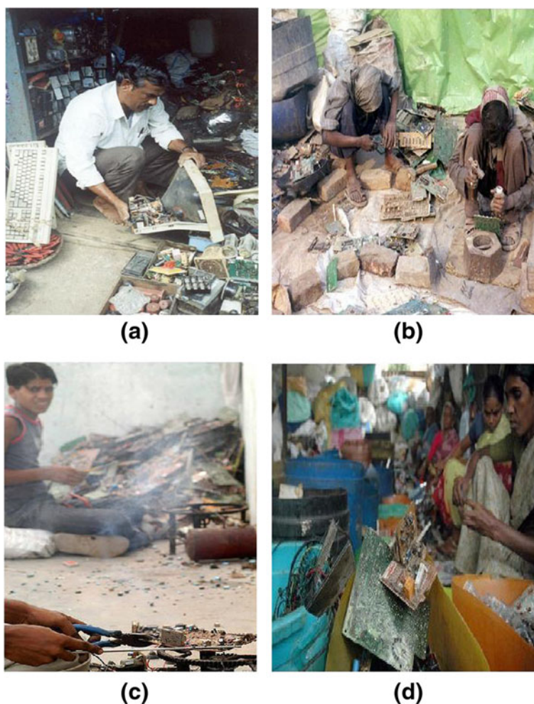
Figure 3 E-waste recycling units in India. (a): E-waste dealer sorting through waste in Chennai. (b): Children recycling toxic e-waste with their bare hands, Delhi. (c): Children extract copper from discarded computer parts. New Delhi. (d): Women working in recycling toxic e-waste with their bare hands.

is used when old WEEE are exported to developing countries and they are often labeled as “second-hand goods” since the export of reusable goods is allowed. On the other hand, most WEEE that does work on arrival only have a short second life and/or are damaged during transportation. The main objectives of the Basel Convention are: