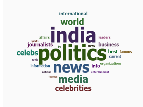
Figure 4. User interests for the handle @narendramodi