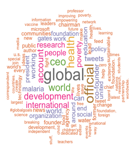
Figure 3. User interests for the handle @billgates