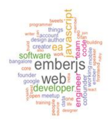
Figure 2. User Interests for the handle @jaydevgajera

This is basically a word cloud having all the Interest Maps that the person has with most interested fields as bigger fonts are then smaller as the least interest. In all the images, the terms have been highlighted using colours and font sizes. This indicates certain significance, like being the bigger text tells that topic which has higher priority than other smaller ones. So from Table1it can be concluded that the first guy is most interested in EmberJS, WEB, Software, JavaScript and so on. While the second person is more like worldwide person and likes to follow business and development, third one is a movie buff and totally into movies and Bollywood.