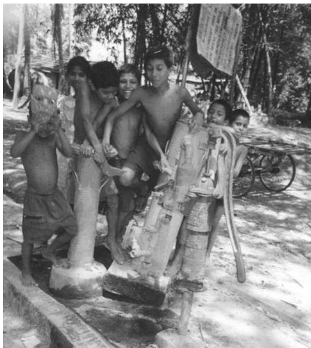
Fig. 3. A defunct ARP which became a plaything for children.