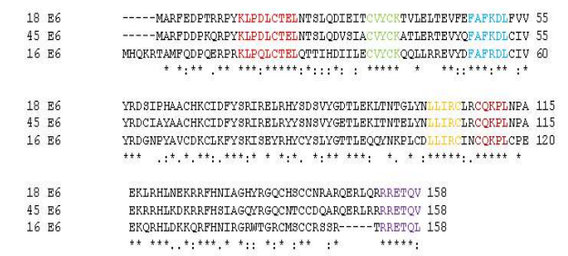
Figure 1. Multiple Sequence Alignment for the three HR-HPVs using CLUSTALW2.1

In addition to the HLA I and HLA II molecules, prediction of immunogenic epitopes in B- cells will be a valid outcome. To achieve this task, we used ABCpred and BCpreds tool for predicting linear B-cell epitopes. The results obtained from ABCpred reveals that the epitope fragment FAFK(R)DL exist as the most prominent epitope in all the three high risk HPVs analyzed. In the case of