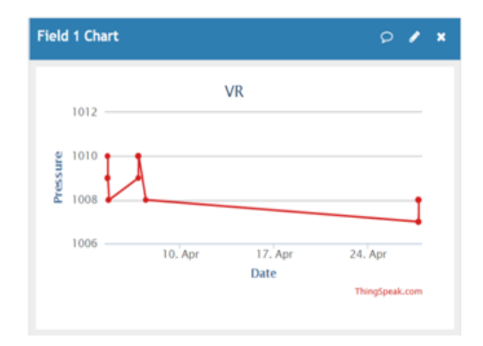
Fig. 1: Pressure Reading

The hardware device comprises of the pressure, altitude and temperature sensor, ldr, Arduino Uno, enc28j60 Arduino Ethernet Shield. The Ethernet shield is primarily responsible for connecting Arduino to the internet. The laptop/pc is connected to the internet via lan or WiFi.