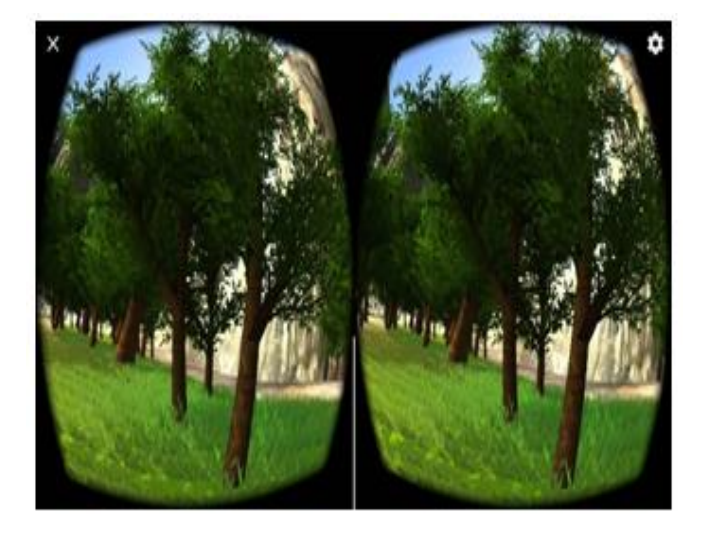
Fig. 3: In simulation environment

After wearing a VR headset the environment comes live before our eyes through Virtual Reality. The image in Fig 10below is a representation of how the game looks in the VR mode.