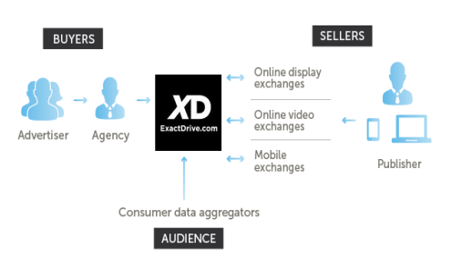
Figure 2. The key role of programmatic advertising in automation [13]

Programmatic advertising has provided the users on two sides of the advertising transaction to which will hike the support of both traditional system of reservation and automation. They provide a guaranteed ad stock and profit revenue to accommodate a large range of system formats by providing better future forecast and allocation space, the reduce will concerns the brand safety and will allow for a better high level of creative . Automation advertising will provide better benefits by developing better strategies. It can also deliver greater campaigning promotion strategies more effectively with well future advance customer targets through list of audience [12]. The PA has capability in targeting as well as optimizing across promotional campaigns for better frequency systems across the spending formats, and the better tracking the advertising across a wide products range. Programmatic advertising plays an important role in building strategies which can improve working efficiency, decreases employee's error, saves more time and effective utilisation of money through one centralised system of trading [13]. The role of programmatic advertising can be understood from the below process work system figure 3